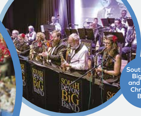
South Devon Big Band and the Big Christmas Bash.