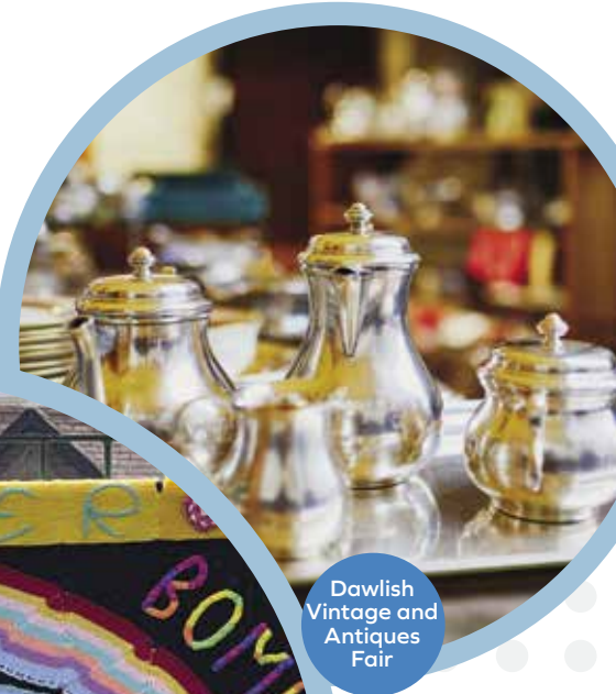
Dawlish Vintage and Antiques Fair