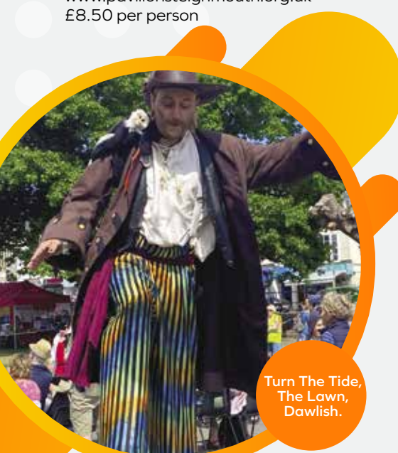
Turn The Tide, The Lawn, Dawlish.