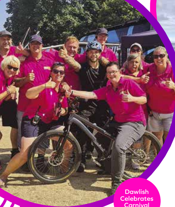
Dawlish Celebrates Carnival 'Pinkies'