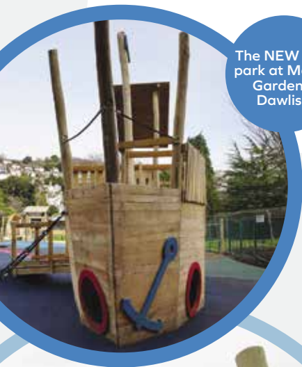
The NEW play park at Manor Gardens, Dawlish