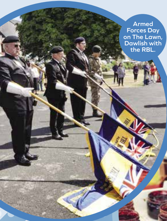
Armed Forces Day on The Lawn, Dawlish with the RBL.