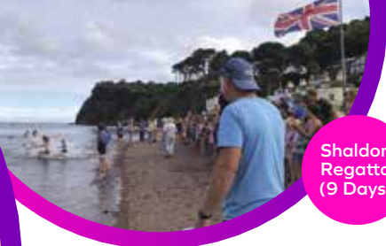
Shaldon Regatta (9 Days)