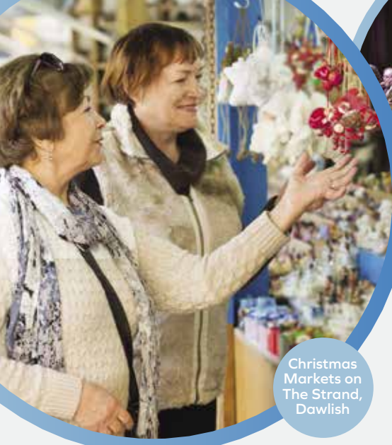
Christmas Markets on The Strand, Dawlish