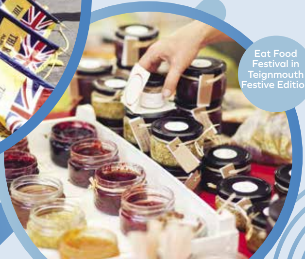
Eat Food Festival in Teignmouth Festive Edition