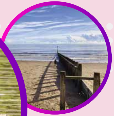
Black Swans at Dawlish, and the beach at Teignmouth