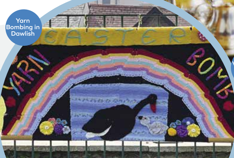
Yarn Bombing in Dawlish